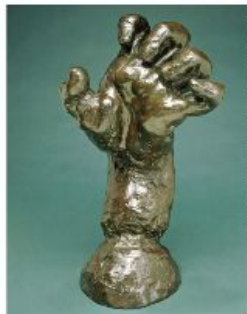
Left: Right

The two enemies glared at each other for a long, silent moment. Each had a rifle in his hand; each had hate in his heart and murder in his mind. The chance had come to release the violence and anger that had grown over a lifetime. But civilized men cannot easily shoot down their neighbors in cold blood, and during this moment of hesitation, Nature’s own violence overwhelmed them both. There was a splitting crash over their heads, and before they could leap aside, a huge section of the beech tree thundered down on them. ■